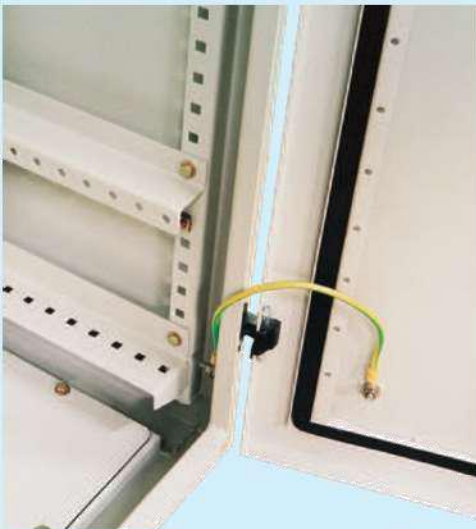
EARTHING BETWEEN BODY & DOOR